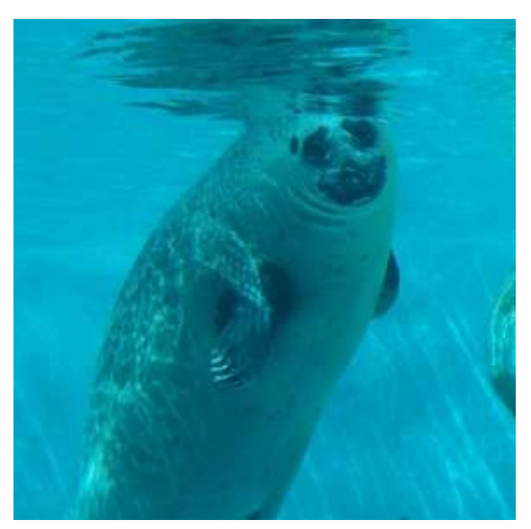
to touch things with?

How do you think seals and sea lions scratch themselves (hint - look at the end of their flippers for nails)